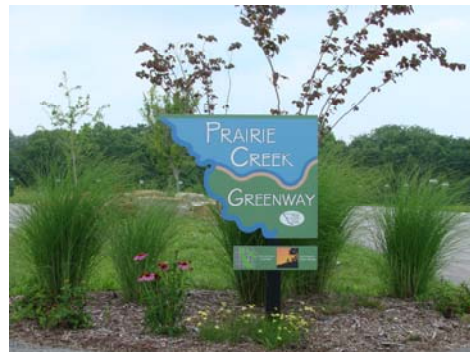
Above: Bridges and The North Trailhead at Prairie Creek Greenway.