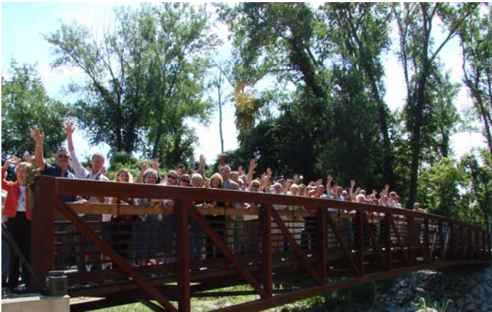
Grand Opening of the Riverfront Trail August 29 th